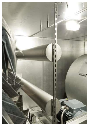
Figure 5: The addition of the exhaust gases from the steam humidification to the exhaust air is carried out through horizontal distribution tubes.