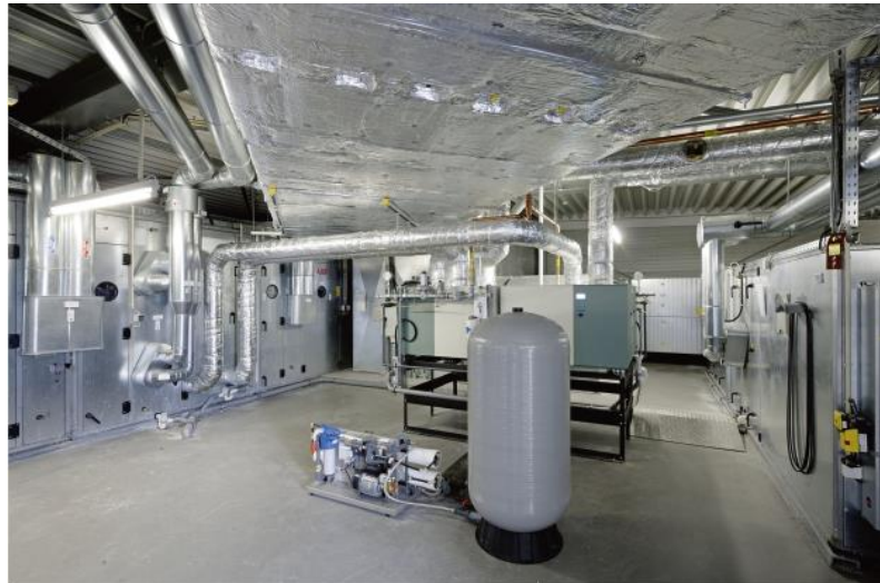
Figure 3: The steam “Condair GS” humidification system (foreground) and the supply air part of the air conditioning system in Campus Kronberg on the left in the background.

A maximum of 400 kg of steam per hour are generated in the steam humidifiers used in Campus Kronberg. From this, approximately 540 kg/h of exhaust gases are produced during burning. By adding these exhaust gases, the exhaust air (36,000 kg/h) is heated by approximately 45 kW or around 4.5 K. Of the 45 kW of heat output added, between around 29 kW (HRE = 65%) and 34 kW (HRE = 75%) is transferred to the cool surrounding air, depending on the quality of the heat recovery in the air conditioning device (heat recovery efficiency = HRE) and the way it is operated (with/without condensation on the exhaust air side). These figures also include the condensation heat. In the combined circulation system used (HRE = 40%), the amount of heat transferred with maximum output from the steam humidification and condensation is approximately 18 kW. The load on the air heater arranged downstream in the air conditioning heat recovery device is reduced by this output.