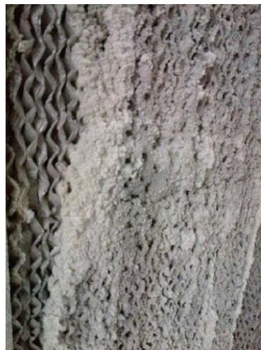
Figure 2: Over the years, heavy deposits have built up on the humidifying honeycomb. This impairs the air humidification and the supply air and causes an increase in the use of the ventilation system to convey air as a result of the significant loss in pressure.

Campus Kronberg was built in 2002 over an area of 32,000 m 2 near Frankfurt. It is made up of two five-story office buildings and a four-story multi-functional building in front of them called the “People’s Forum” with rooms for conferences, training sessions, and celebrations, and a restaurant. The almost entirely glass buildings, which were designed by the architecture firm Kaspar Krämer Architekten BDA from Cologne, have a total floor space of 29,000 m 2 and spaces for 728 cars in an underground parking garage that extends over three floors. The main tenant is Accenture, a management consultancy, technology, and outsourcing service provider, whose headquarters for Germany, Austria, and Switzerland are based here. Bilfinger HSG is the Facility Management service provider for the entire Campus Kronberg area.