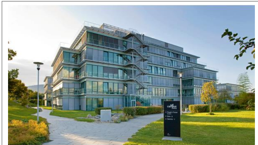
Figure 1: The Campus Kronberg building complex was completed in 2002.

In steam humidifiers, drinking water which has previously been softened in a softening and reverse osmosis machine is desalinated and demineralized at approximately 100°C. In the “Condair GS” series, the energy needed for this comes from a gas firing. Previously, the waste gas generated from this had to be discharged out into the open via an exhaust gas line and a separate chimney on the roof, a process which was expensive. In the opinion of the DVGW, the exhaust gases from steam generation can now be added to the exhaust air from the building and discharged out into the open via the air conditioning system. This procedure has three advantages: